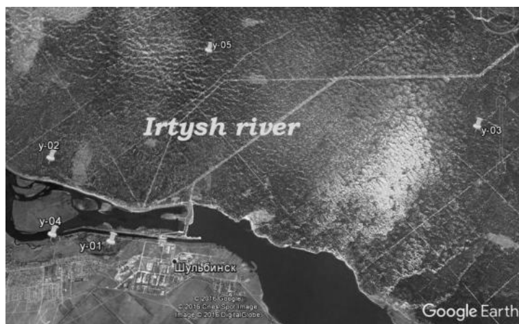
Figure 6. Sampling map (5 samples from near the river Irtysh)