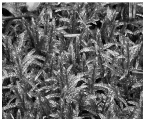
Figure 2. Pleurozium schreberi