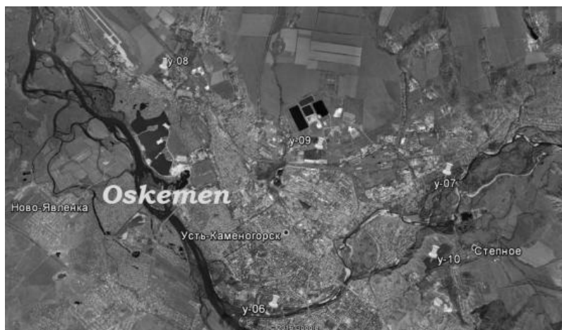
Figure 5. Sampling map (5 samples from Ust-Kamenogorsk)