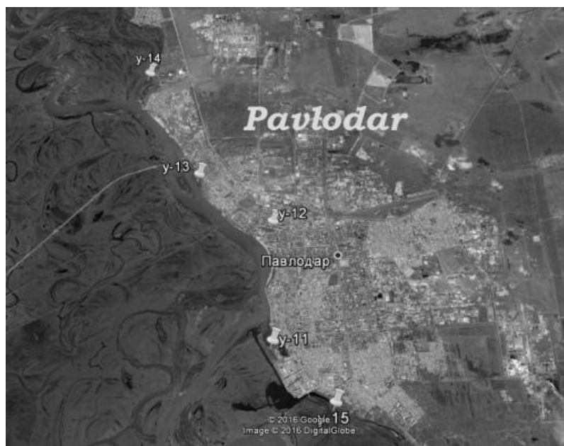
Figure 4. Sampling map (5 samples from Pavlodar)