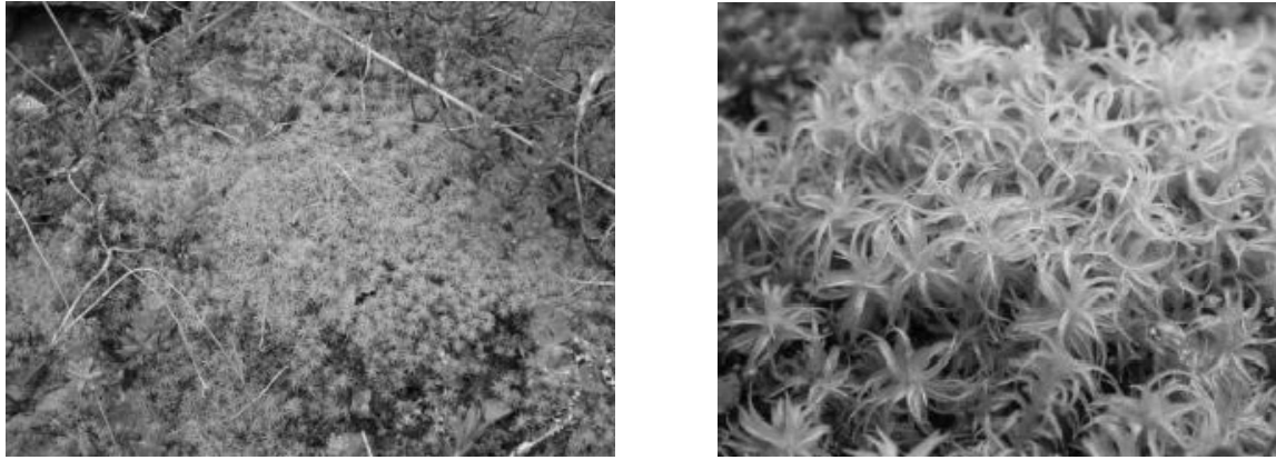
Figure 3. Pleurochaete squarrosa